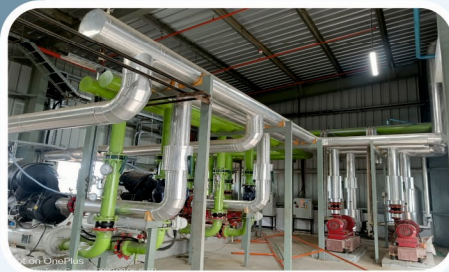
Project @ Paharpur 3P