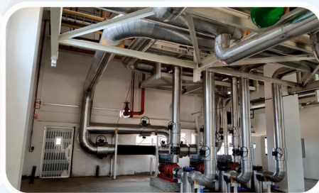
Project @ Kimberly Clark