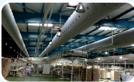
Project @ Britannia