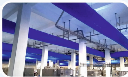
Project @ Milky Mist