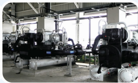
Project @ Loreal