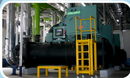
Project @ General Motors