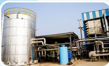
Project @ Deepak Fertilisers