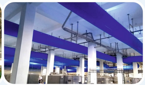
Project @ Milky Mist