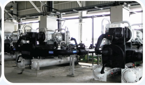
Project @ Loreal