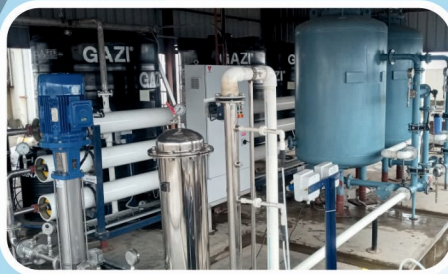
Project @ Bombay Sweets