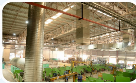
Project @ JCB