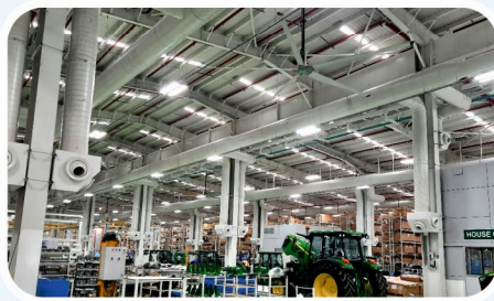
Project @ John Deere