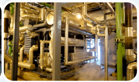
Project @ Anantara, Maldives